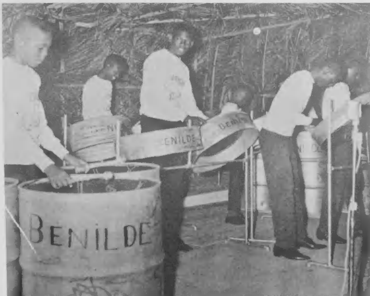
Benilde Saints - 2nd Place Winner